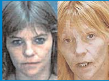
Same person, chronic METH user